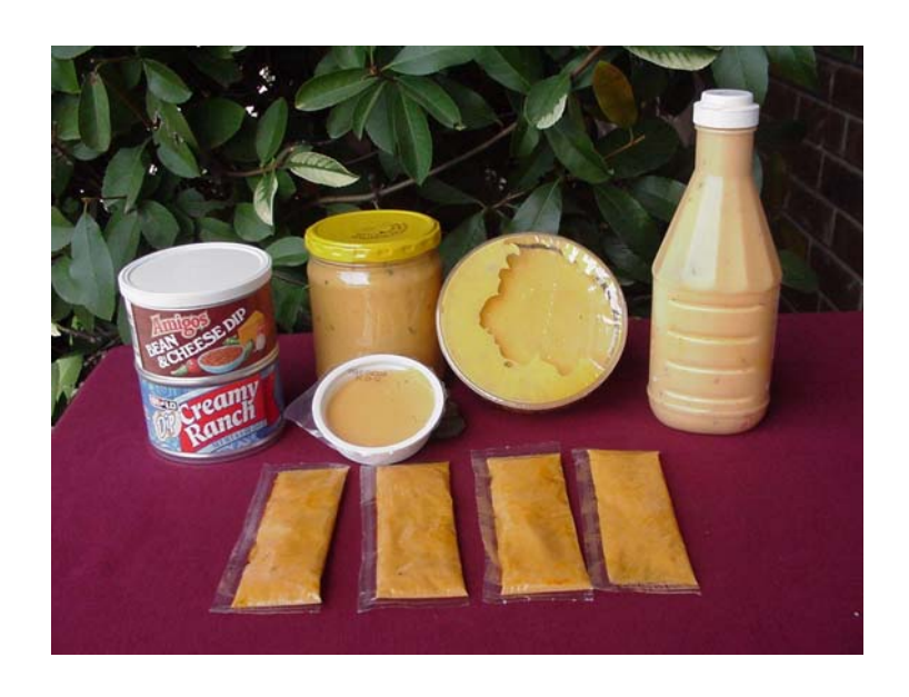
Jars, Pouches, Portion Packages, Chubs, Deli Cups, and Squeeze Bottles.

Our Products are designed to fit a variety of packaging possibilities.